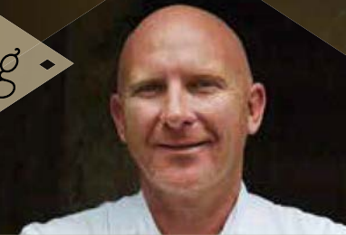
CHEF MATT MORAN